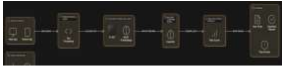
Fig1: Architecture of system.